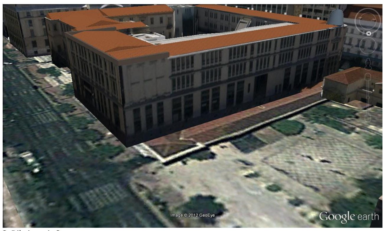
C. Dikaiosynis Square