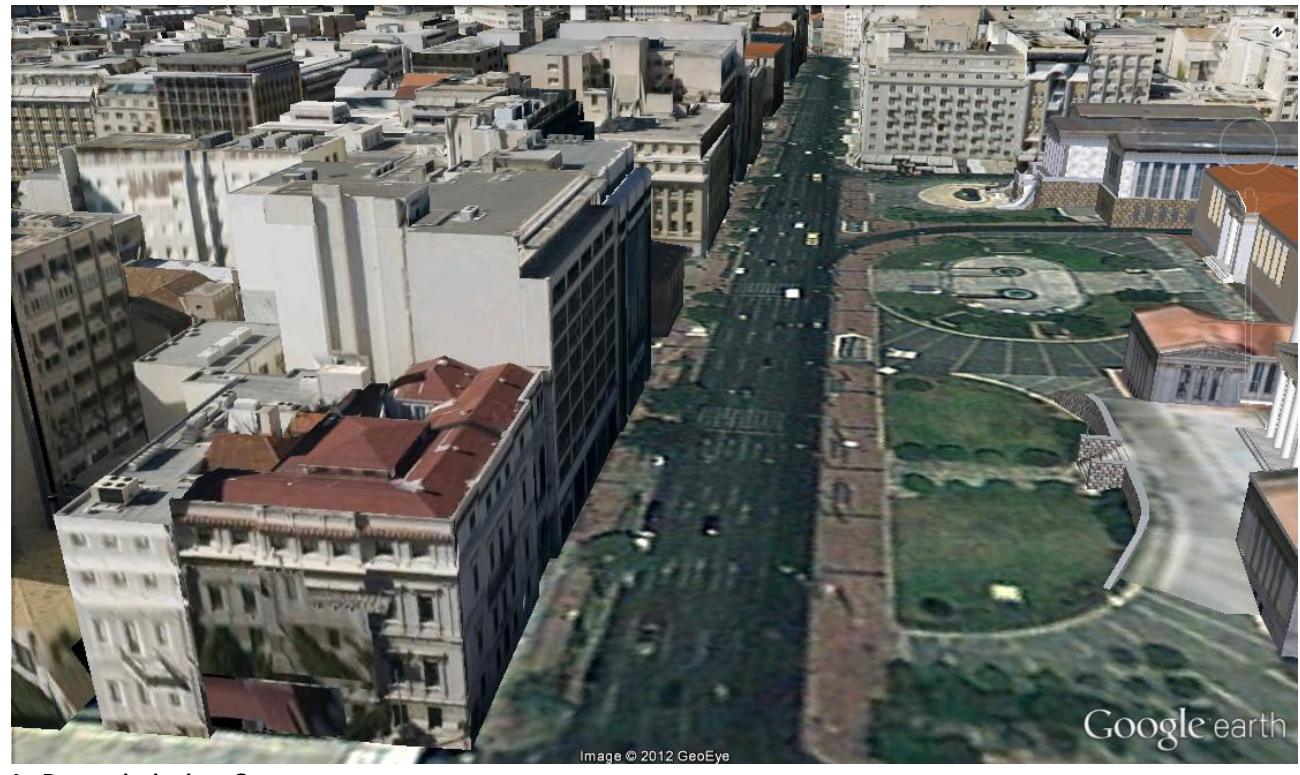
A. Panepistimiou Street