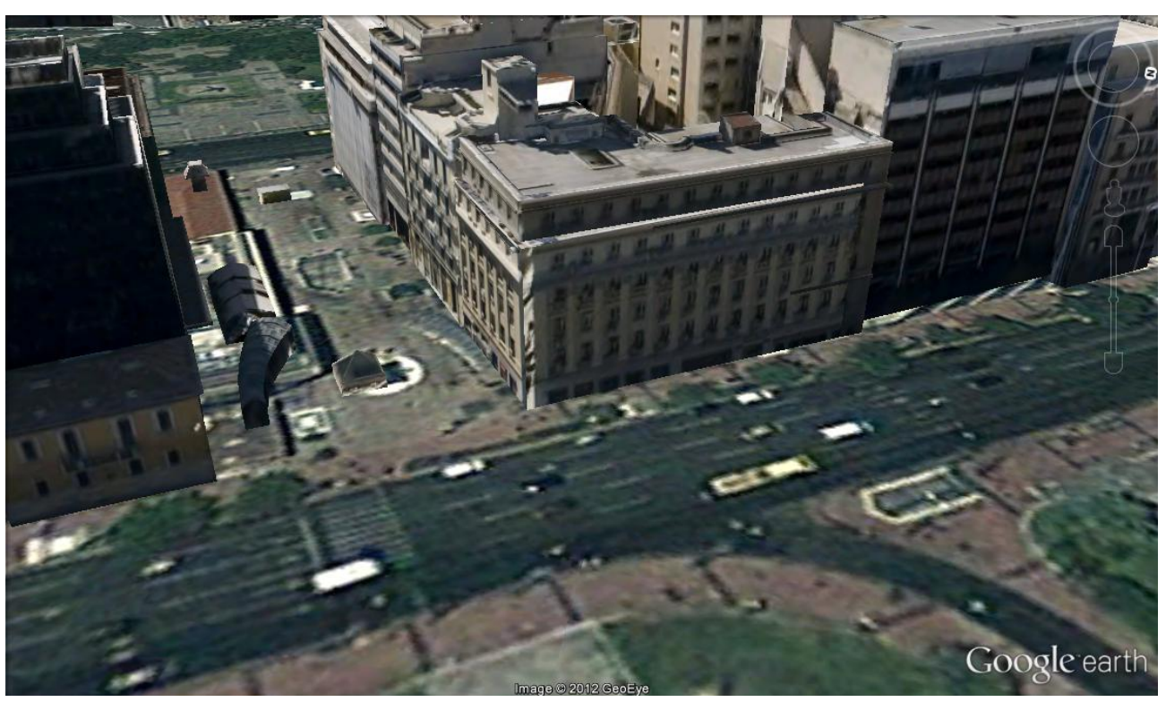
D. Korai and Panepistimiou Street